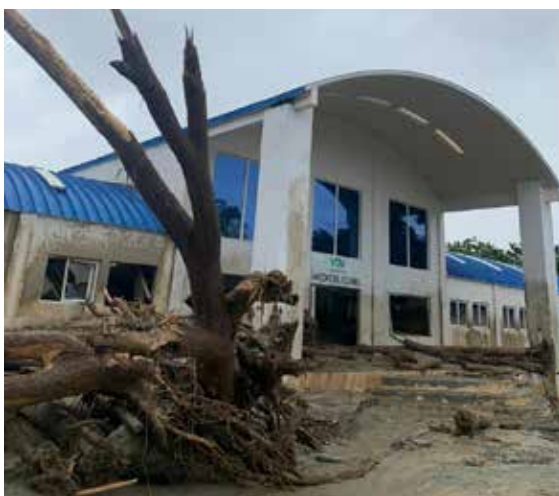
When Hurricanes Eta and Iota struck the Hope of Life campus, the river overflowed its banks and ripped through the valley. The Hope of Life community clinic was severely damaged by the flood waters. It was a total loss.